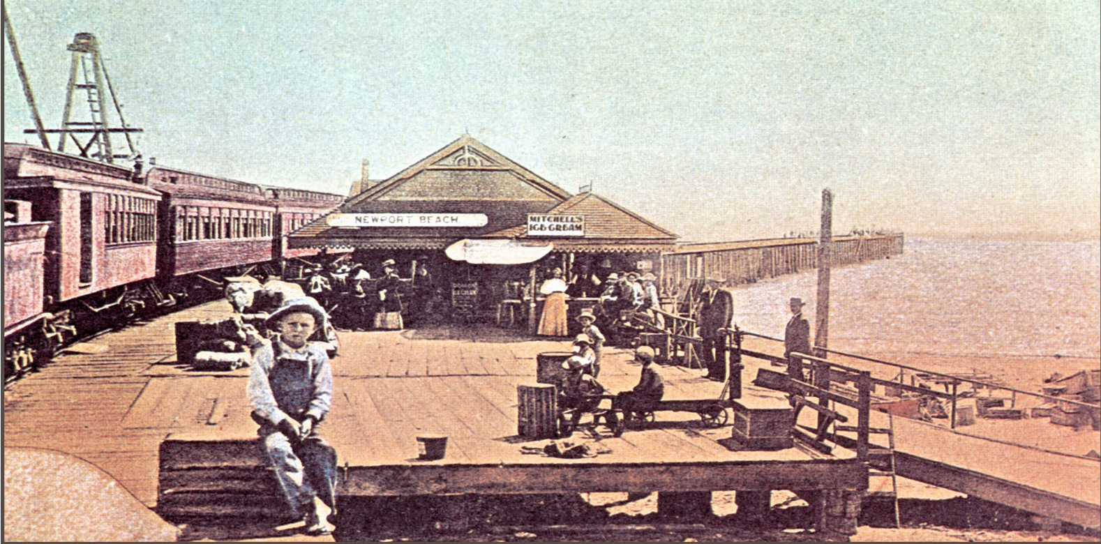
Depot and Wharf at Newport Beach, Cal.

On August 21, 1906 , Newport Beach votes to incorporate as a city. The measure to incorporate passed by a margin of 44 to 12.