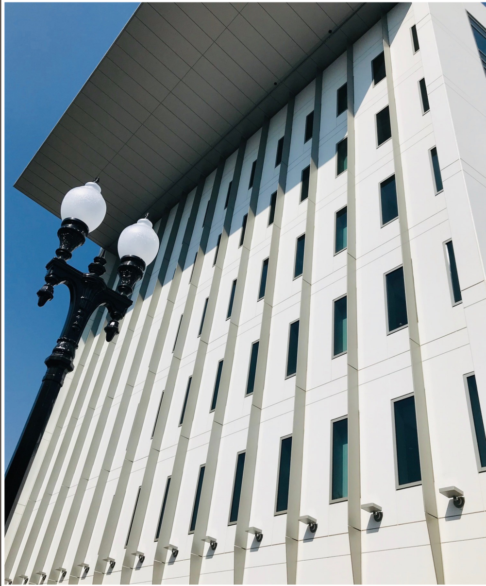
One of our staff took this photo of the County Administration South building during a walk through the civic center in Santa Ana.

This section will feature photos taken by department employees while they were out and about to help close our newsletter on a good visual note.