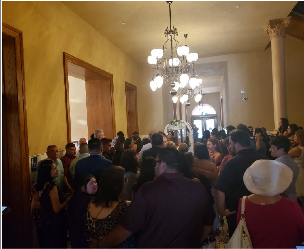
Another busy day during our last special Saturday opening at the Old County Courthouse in Santa Ana.