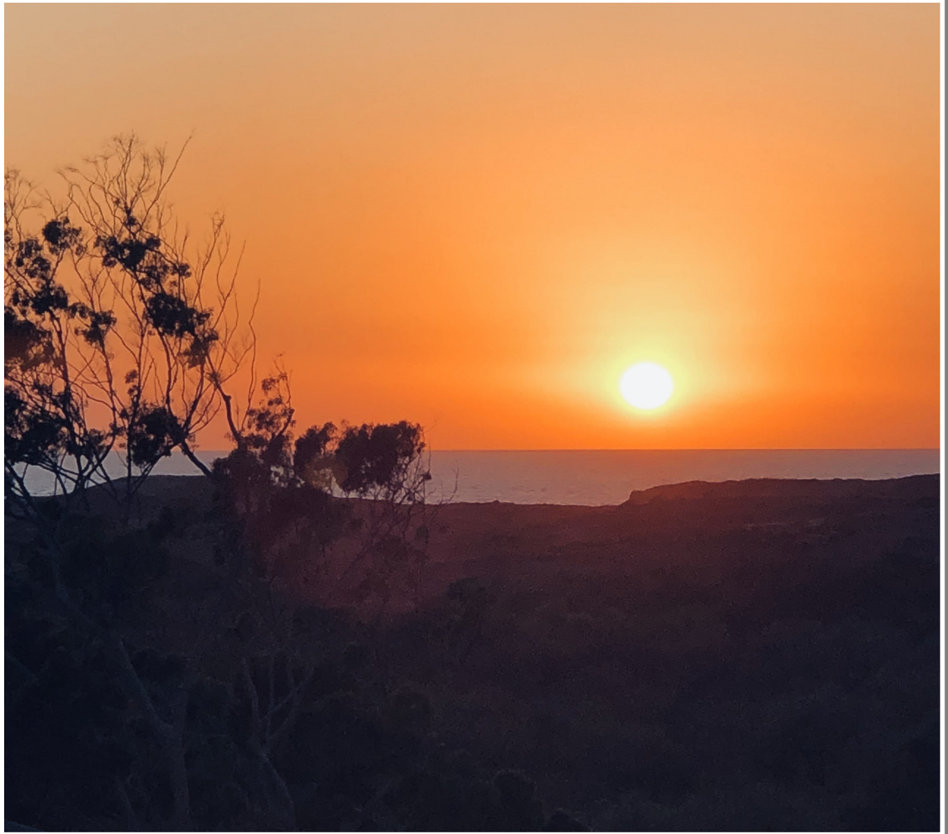
One of our staff took this photo of a beautiful San Clemente sunset.

This section will feature photos taken by department employees while they were out and about to help close our newsletter on a good visual note.