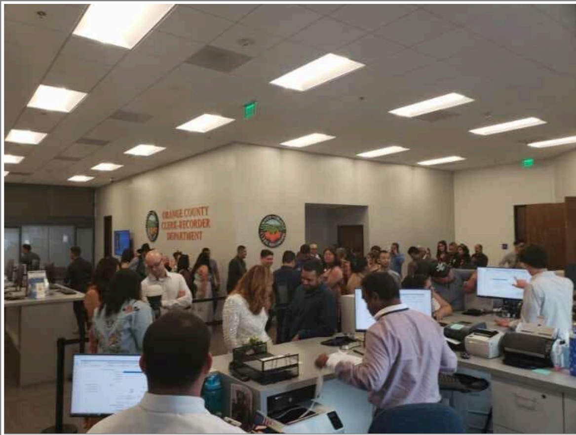
Another busy day during our last special Saturday opening at our branch office in Anaheim.