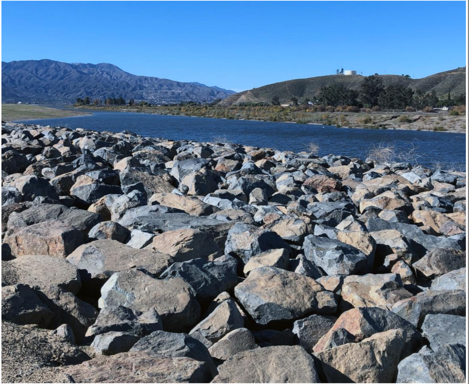
One of our staff took this shot of Lake Elsinore during a morning hike.

This section will feature photos taken by department employees while they were out and about to help close our newsletter on a good visual note.