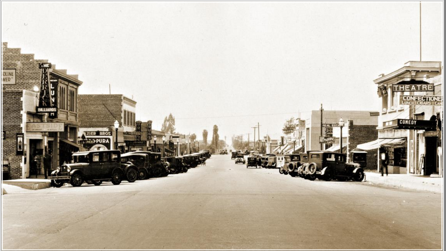
Downtown La Habra in the 1920's