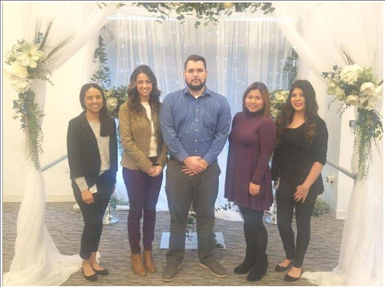
Staff from our North County branch office in Anaheim ready to serve during January's special Saturday opening.