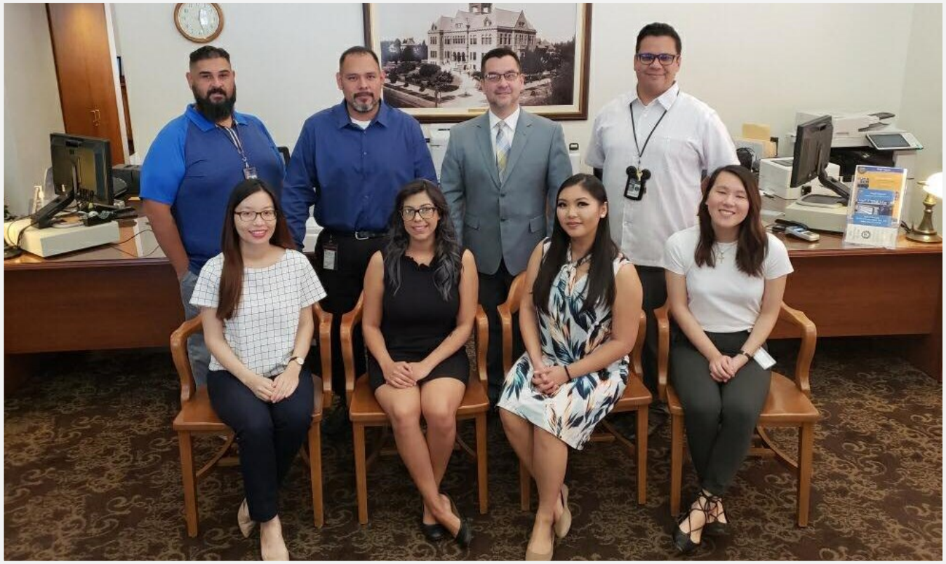
Staff at our Central office ready to serve the public during one of our special Saturday openings.