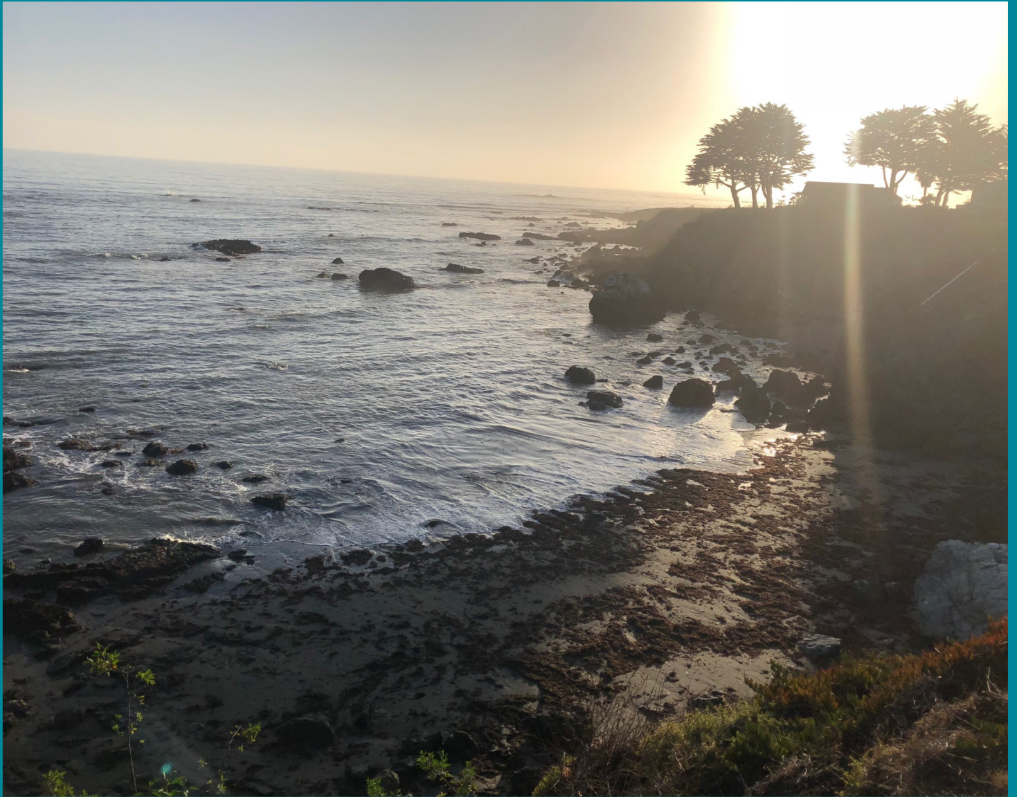
One of our staff took this shot of the California Coast during a recent road trip.

This section will feature photos taken by department employees while they were out and about to help close our newsletter on a good visual note.