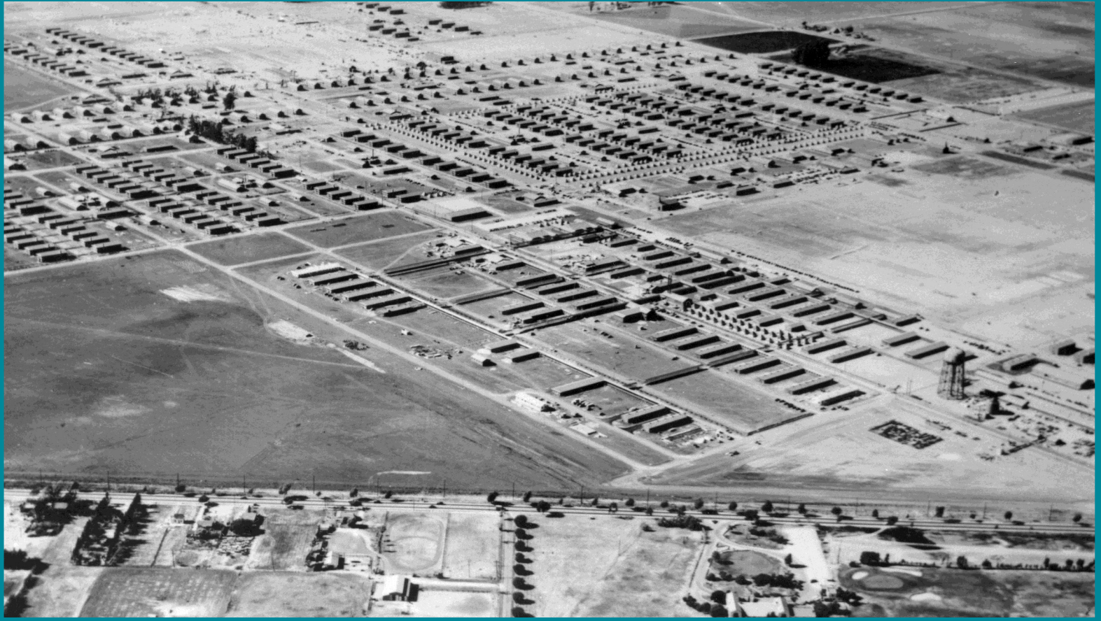
Santa Ana Army Air Base (SAAAB), looking west, with Newport Blvd. in the foreground.