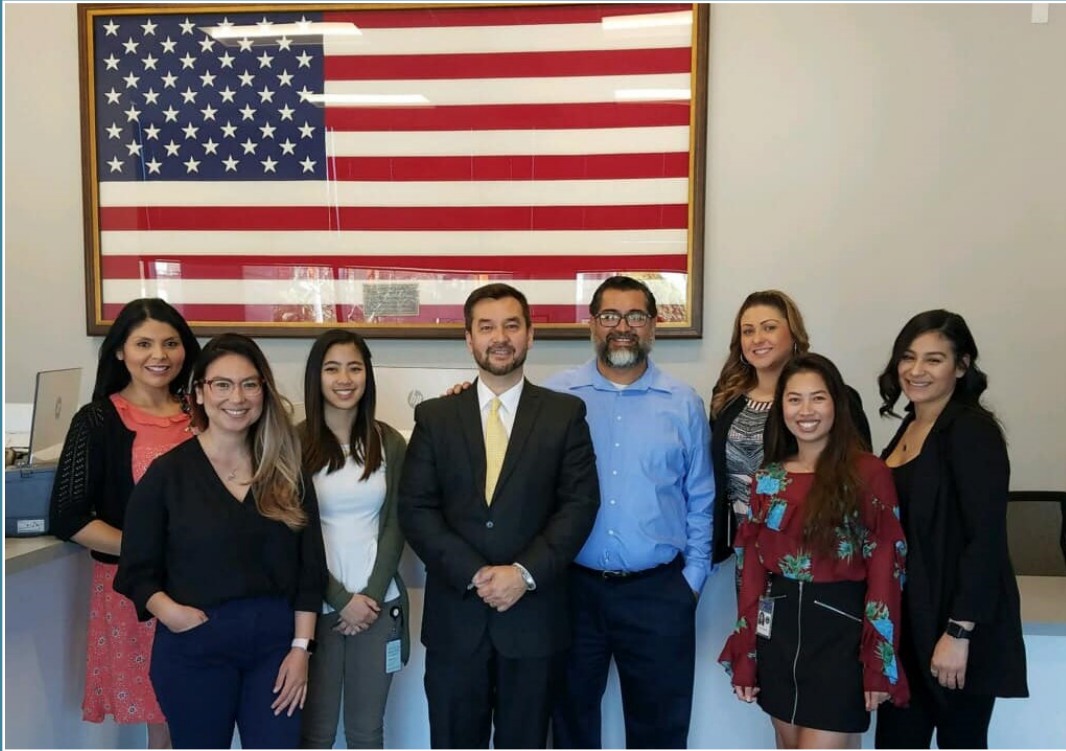
Clerk-Recorder staff at the Anaheim location's inaugural Special Saturday opening.