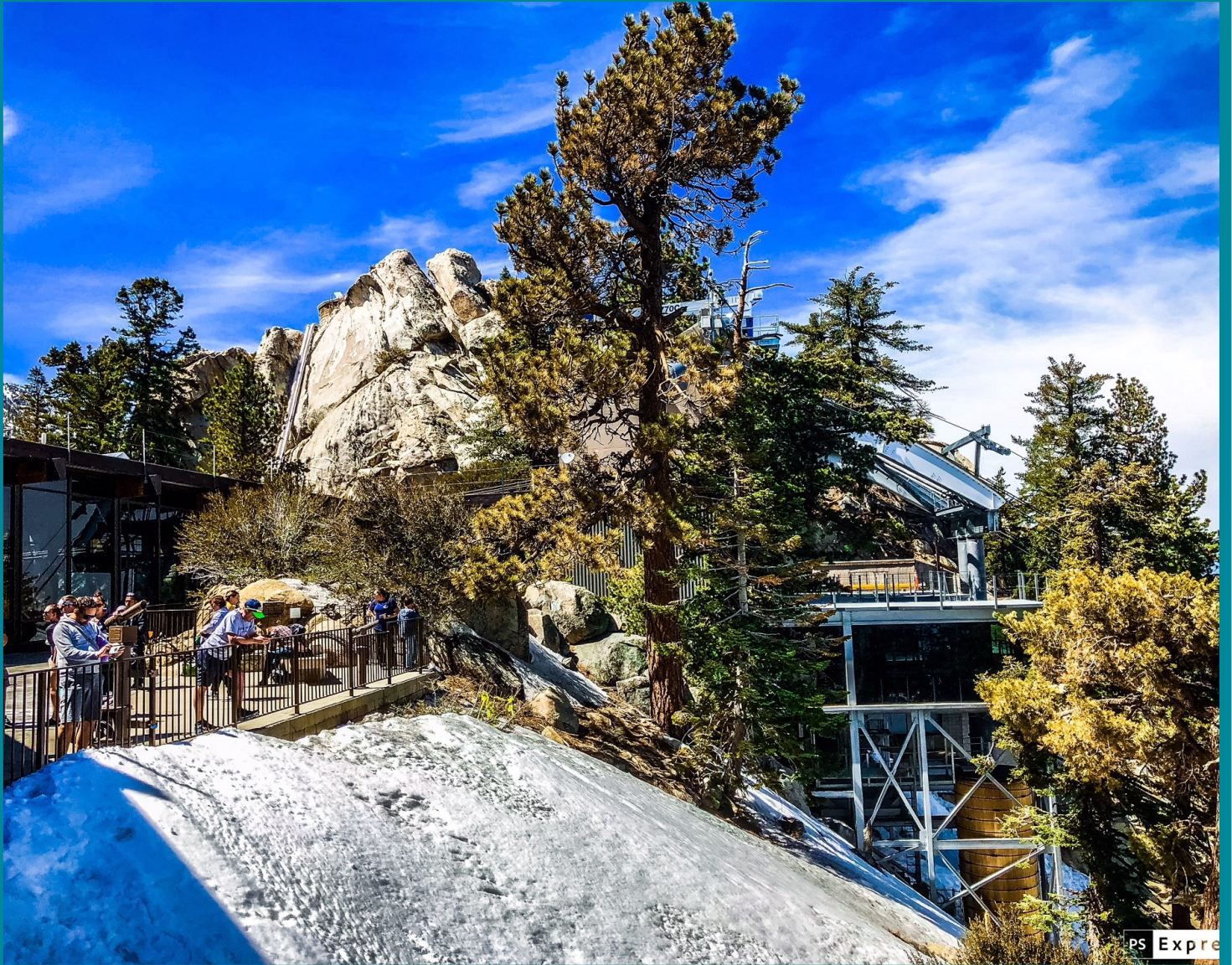
One of our staff took this photo of the observation deck at the top of the Palm Springs Aerial Tramway.

This section will feature photos taken by department employees while they were out and about to help close our newsletter on a good visual note.