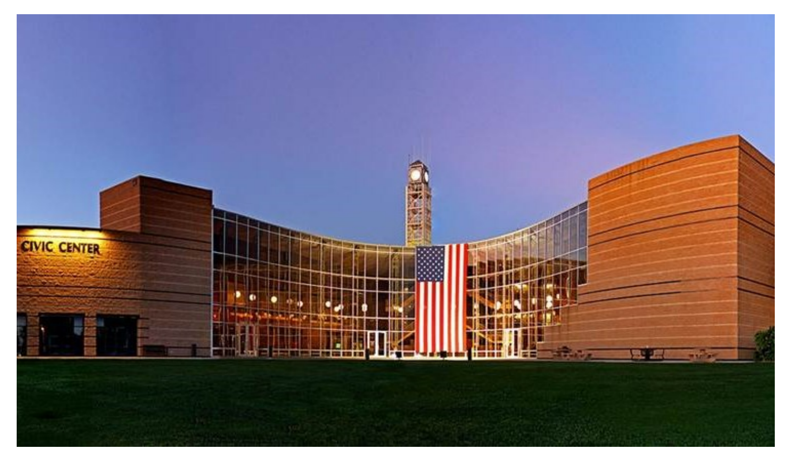
On December 21, 1971, voters approved the incorporation of the City of Irvine by a 2-to1 margin.