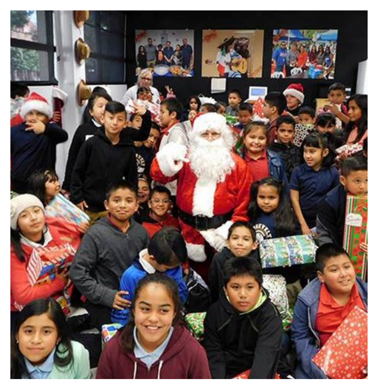
Santa with children who attended this year's Giving Back to the Community event.