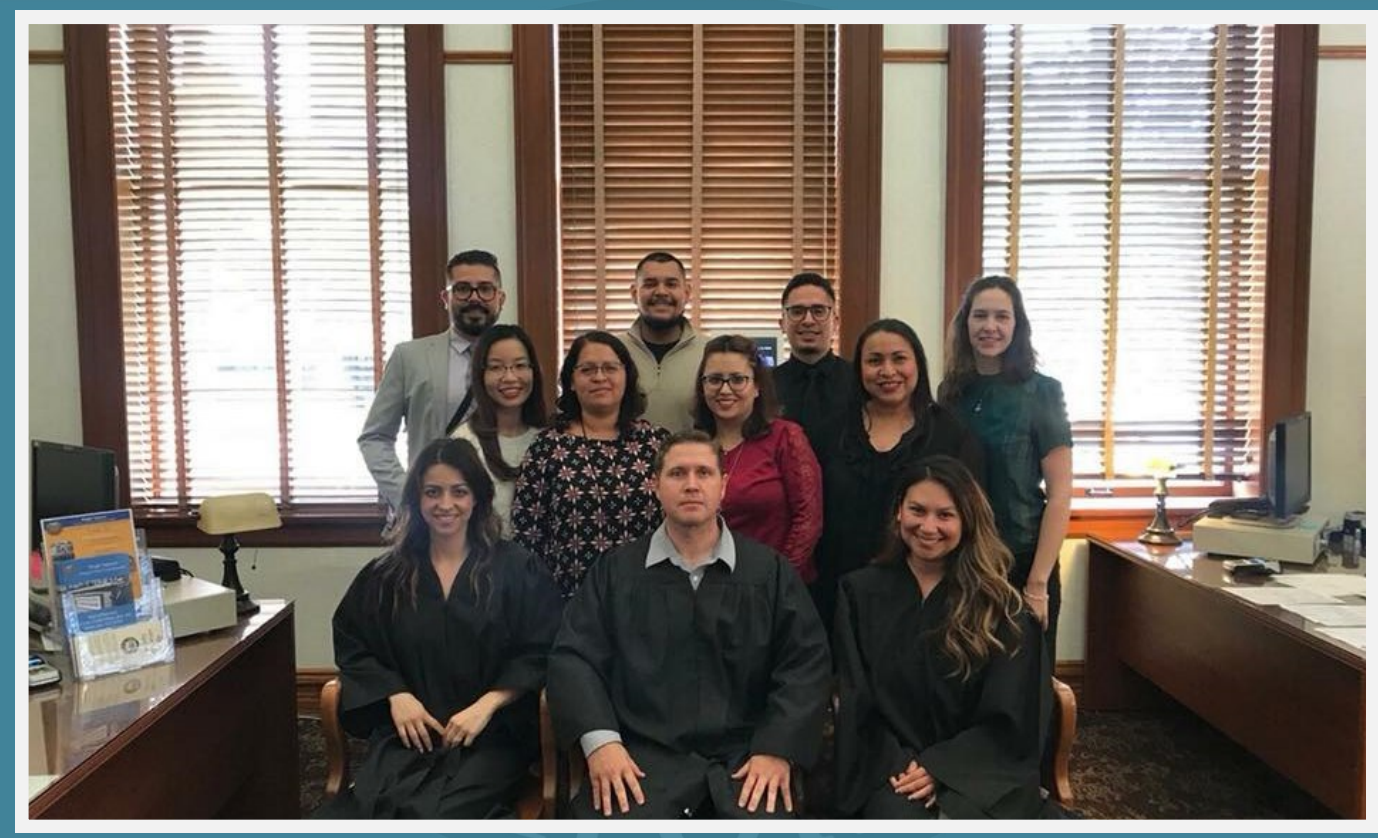
Staff at our Central office ready to serve the public during our special Saturday opening.