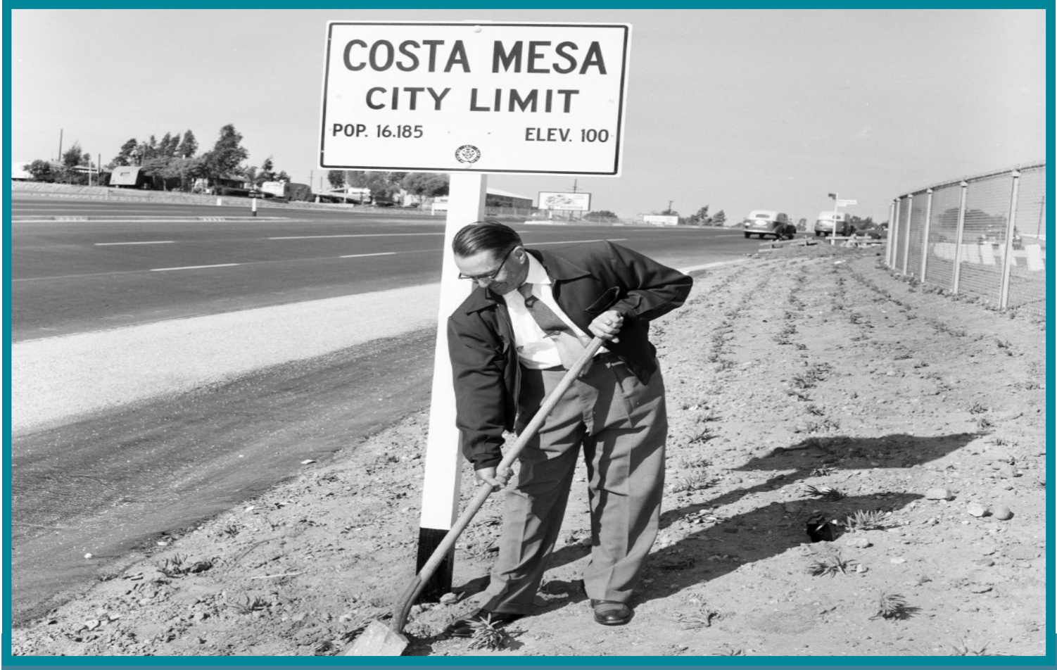
Costa Mesa's first mayor, Charles TeWinkle, installs sign, Sept 1953.