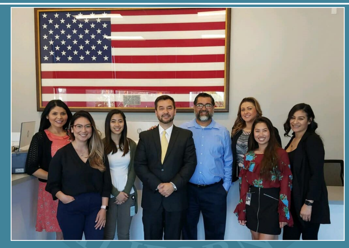
Clerk-Recorder staff at the Anaheim location's inaugural Special Saturday opening.