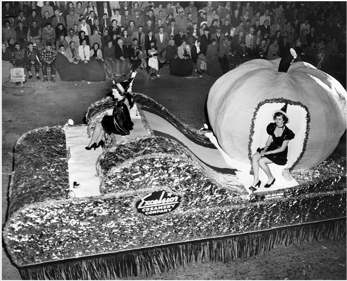
Excelsior Dairy's float in the Anaheim Halloween Parade, circa 1940s.