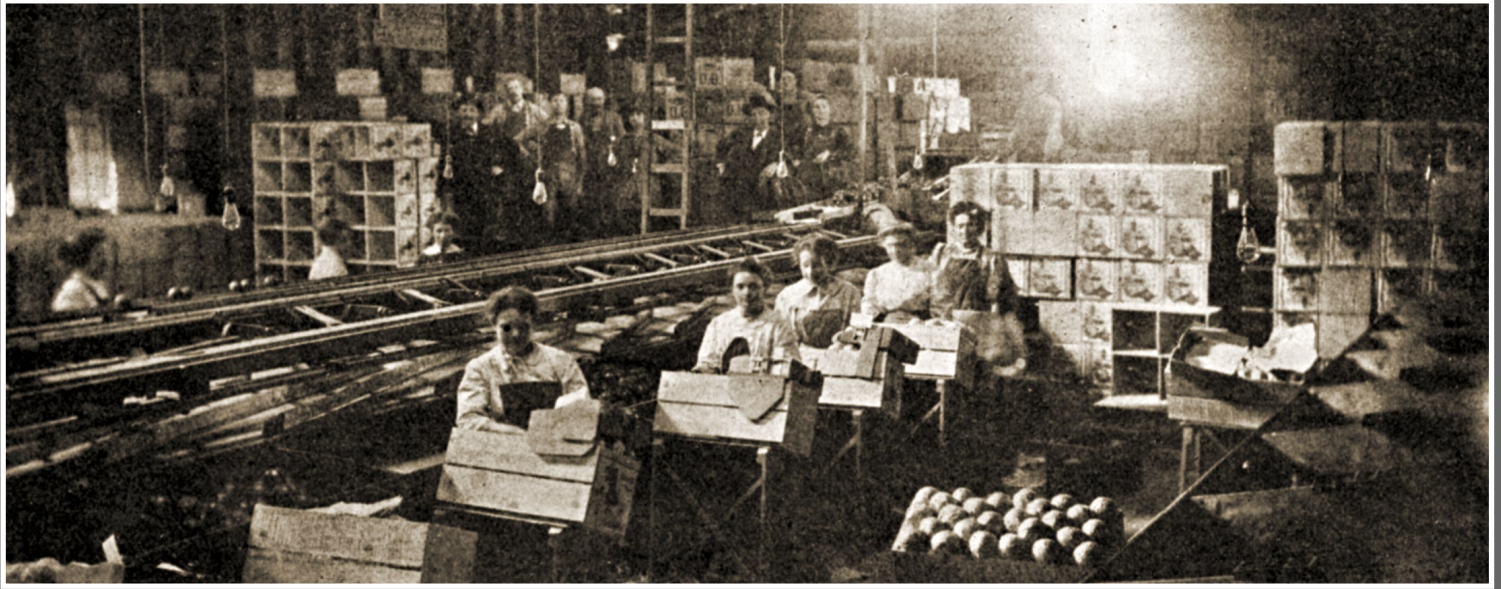
Workers in the Placentia Orange Growers' citrus packing house, Fullerton, 1910