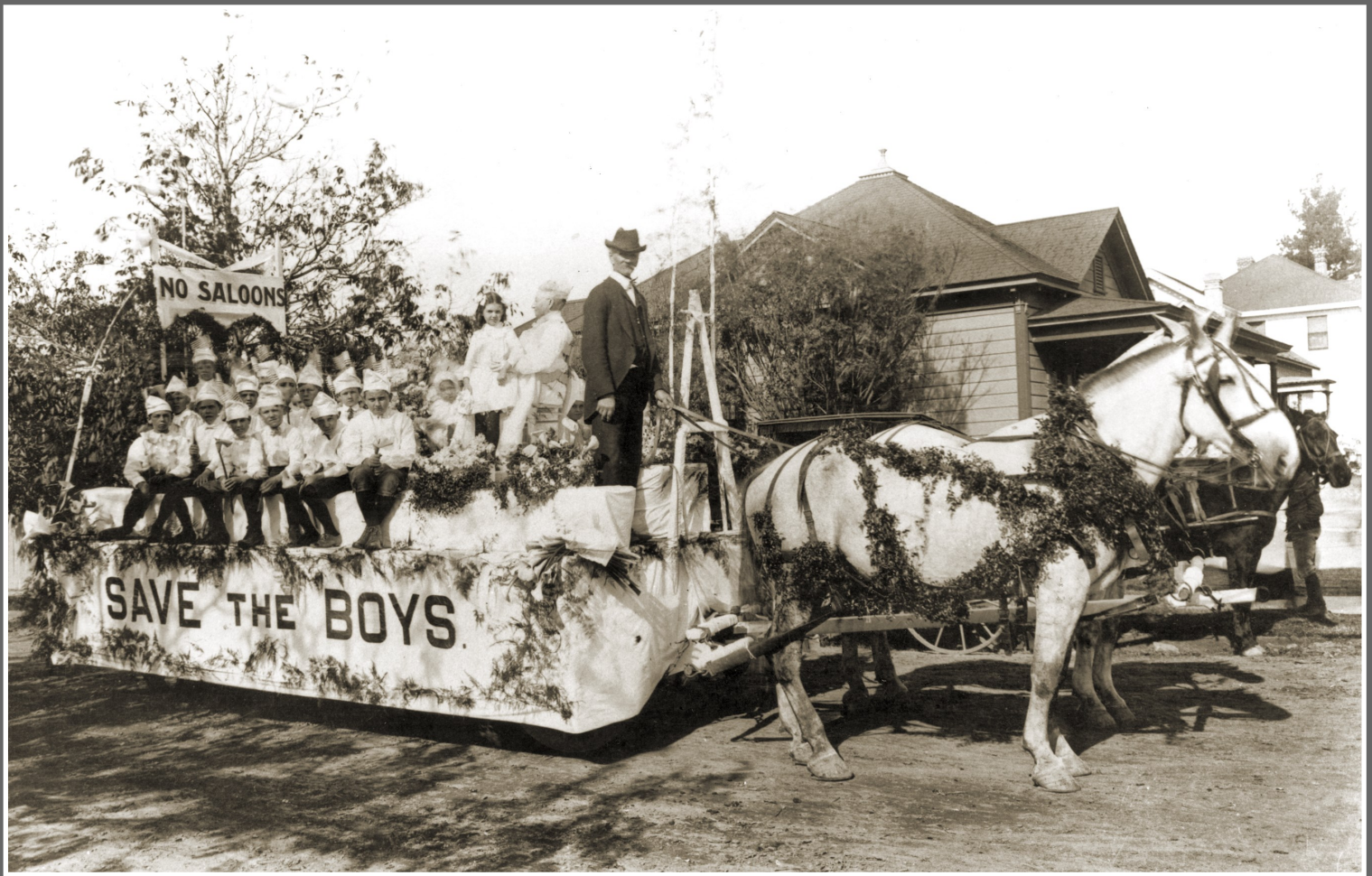
Parade float of the Women's Christian Temperance Union, Santa Ana, circa 1900.