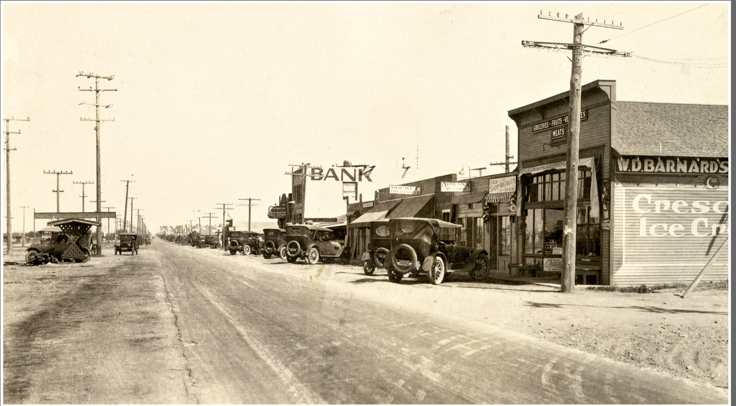
Downtown Costa Mesa, shortly after the town changed its name from Harper.