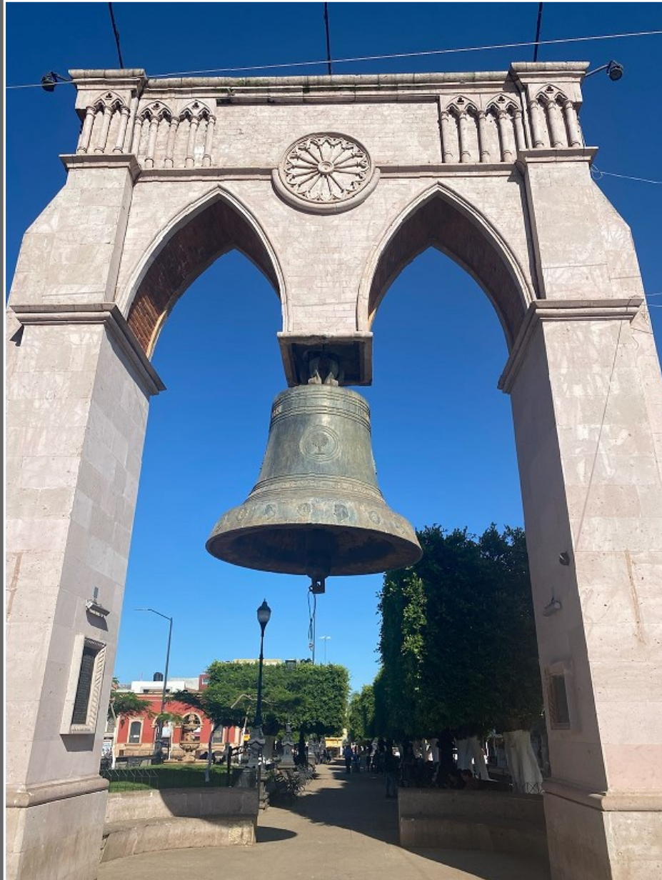
One of my staff took this photo of the Bell at Templo de San Jose Obrero while visiting Arandas, Jalisco.