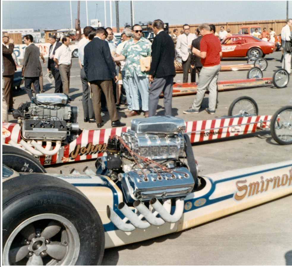
Scene at the Orange County International Raceway, off Sand Canyon Ave. in Irvine, on or around opening day, August 1967.