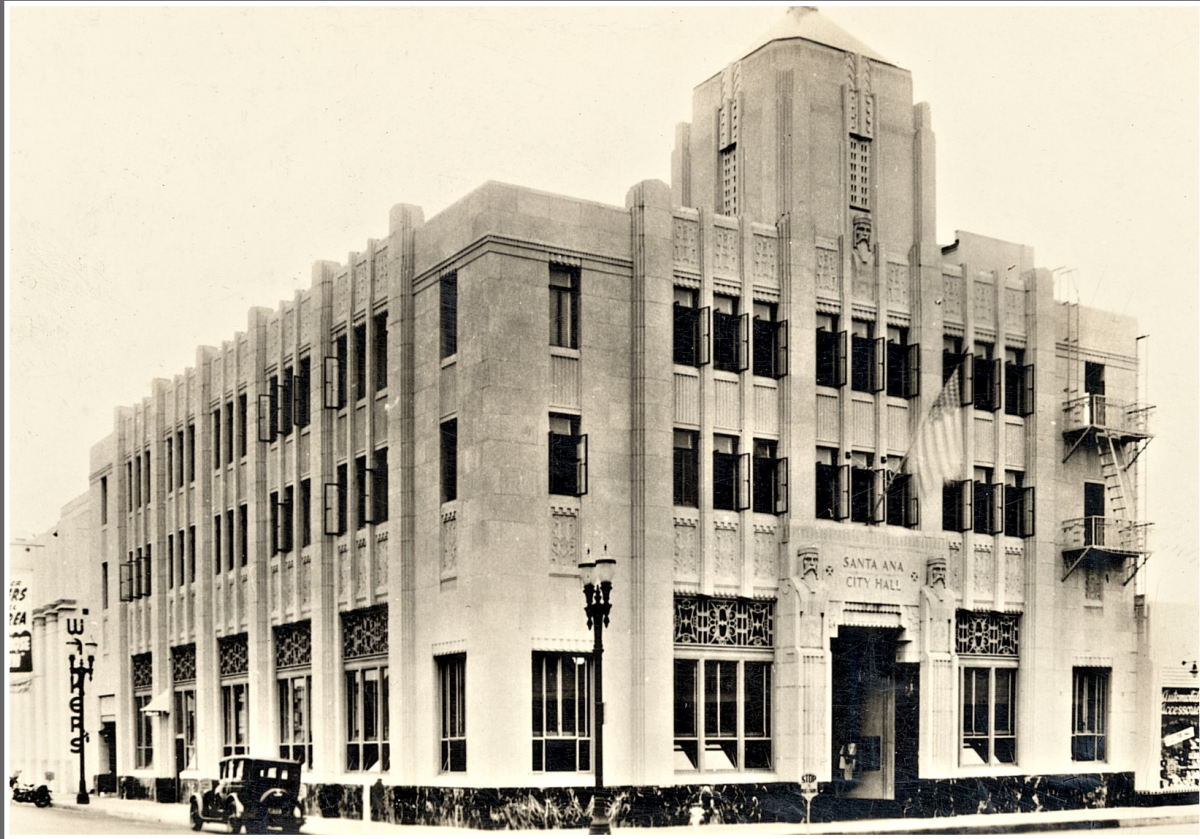
A postcard view of Santa Ana's new City Hall in the mid-1930s.