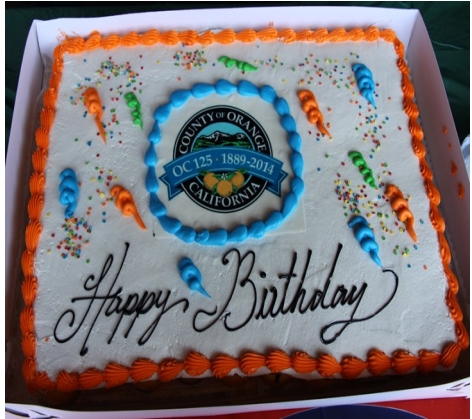
It wouldn't be a party without the birthday cake!!