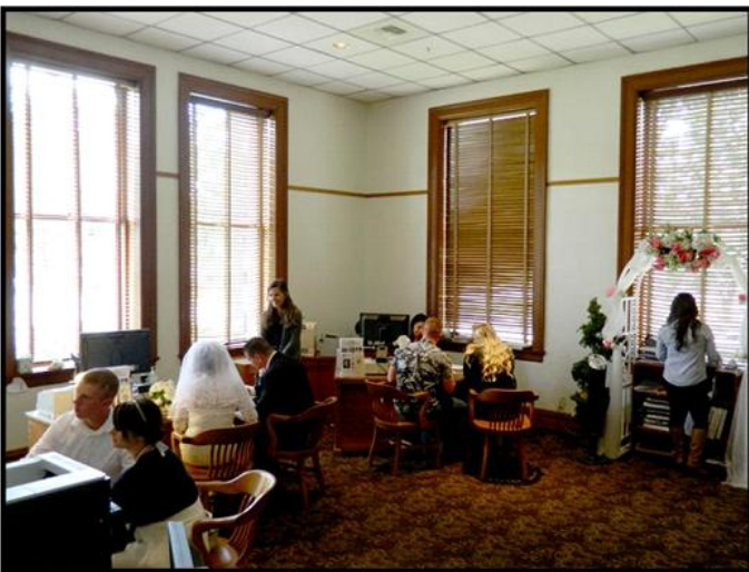
The department averages about 100 marriage ceremonies and 150 marriage licenses on a Saturday opening